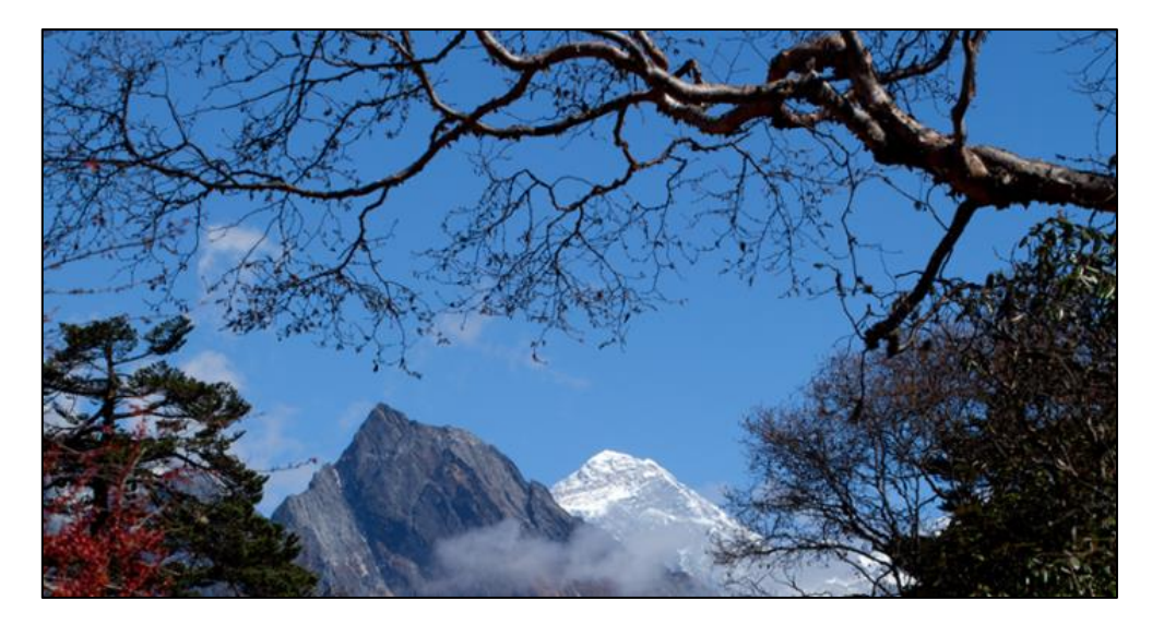
Trek time: 3-4 hours. Dinner and overnight at the Basanta Lodge.

You can expect to arrive into Dhampus, where you rest tonight, early this afternoon. Here you stay at Basanta Lodge, from where there are sweeping views of the entire Annapurna Range. After lunch at the lodge there will be an optional walk through the old village of Dhampus in the company of your guide.