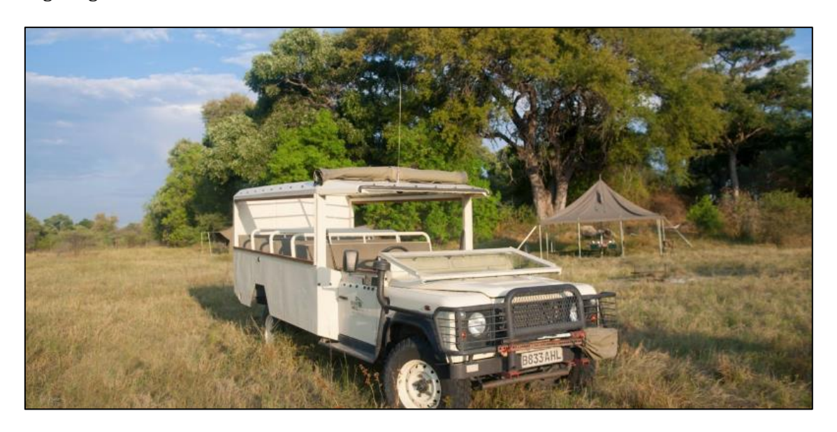
See price guide overleaf

Set off early this morning, enjoying a game drive as you depart the Delta region and continue to Maun. Expect to arrive in Maun around noon. On arrival, you will be dropped off at the airport or at your hotel if overnighting in Maun.