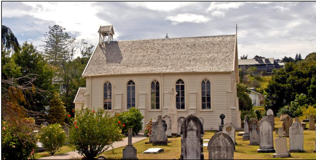
Christ Church, Bay of Islands

during the cruise. On your return voyage, make a stop at Urupukapuka Island for a swim or stroll around Otehei Bay.