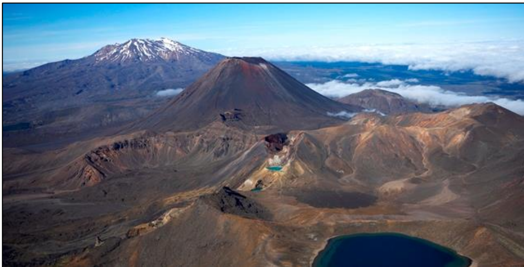
Tongariro National Park

There's no shortage of great restaurants in Wellington, many within walking distance of the Ibis.